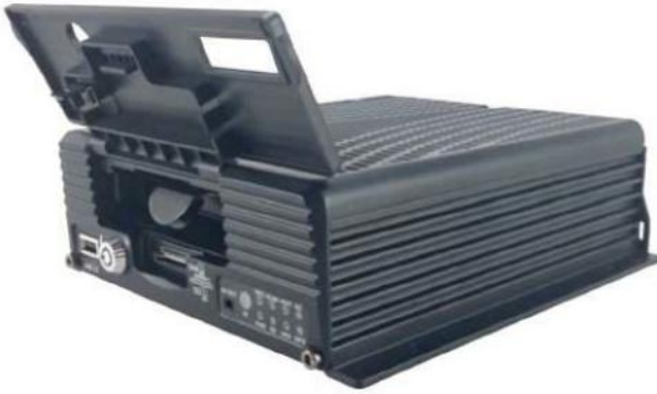
Front Panel – HDD /SD Storage